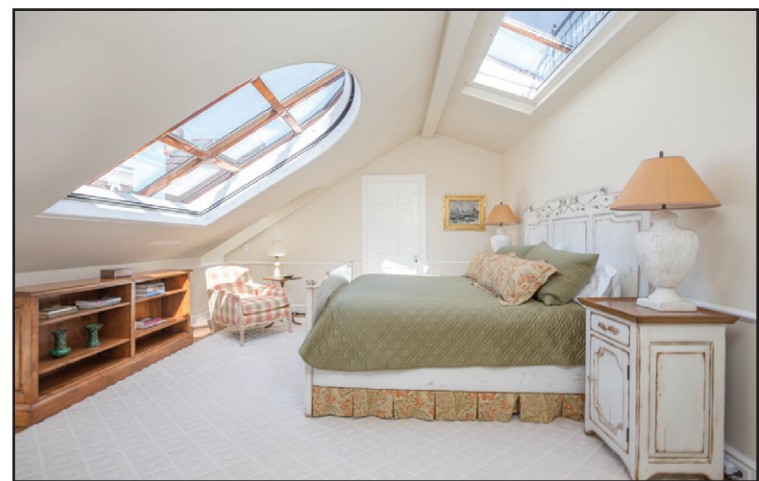
The master bedroom has a huge, stunning, arched skylight, plus a second skylight above the king-size bed.

Two skylights – a rectangular one with more copper trim is above the king-size bed, and a massive arched one is directly opposite the bed – are other treats. Both have remote-controlled shades, and you can choose between regular or blackout versions.