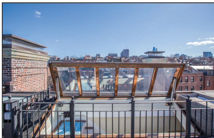
The copper-framed skylight/hatch that opens onto the roof deck is motorized.

Beadboard wainscoting – it's 4 feet high on one wall – and a long line of overhead glass-front cabinets with under-cabinet lighting are