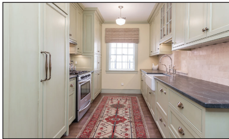
The galley-like kitchen features honed granite-topped counters, high-end appliances and custom cabinetry. A butler's pantry includes even more cabinets.