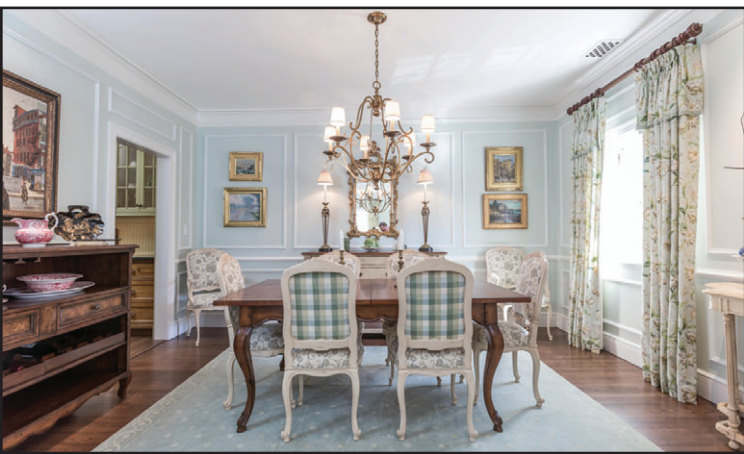
The formal dining room, adjacent to the living room, includes crown molding, a chair rail and shadowbox paneling.

On a practical note, this home has four heating and four cooling zones.